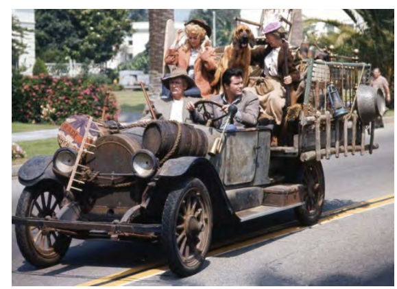
On our way to striking it rich in the hills of Calico.