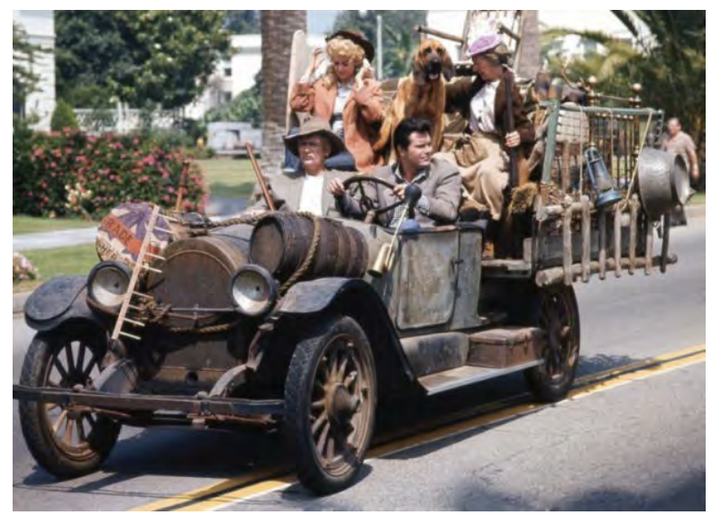
Early travelers on their way to striking it rich in the hills of Calico.